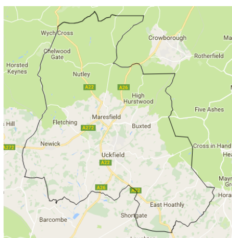
Uckfield with Herons Ghyll