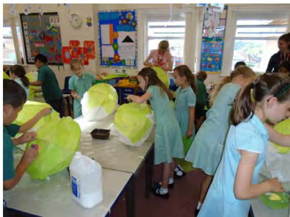
Pupils collaborating and learning together.

We teach the National Curriculum throughout the school. RE, English and Maths are at the heart of what we teach and the central core skills that we develop in every child, in order to enable them to fulfil their potential; to make a valuable contribution to the community; and to prepare them for secondary schools and the world of work.